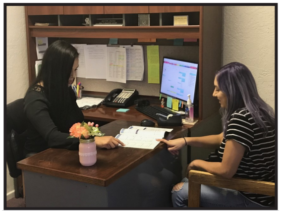
Financial Aid Guidance Somerton, AZ

Regional Center for Border Health, Inc. College of Health Careers Financial Aid Department will confirm the academic progress of all students before any disbursement is made to ensure that only those students who are making Satisfactory Academic Progress (SAP), are considered to be in good standing and eligible to receive Federal Financial Aid.