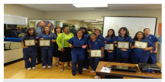
Graduation Class, Parker, AZ

The Regional Center for Border Health, Inc. College of Health Careers Institute does not guarantee job placement to graduates upon program completion or upon graduation.