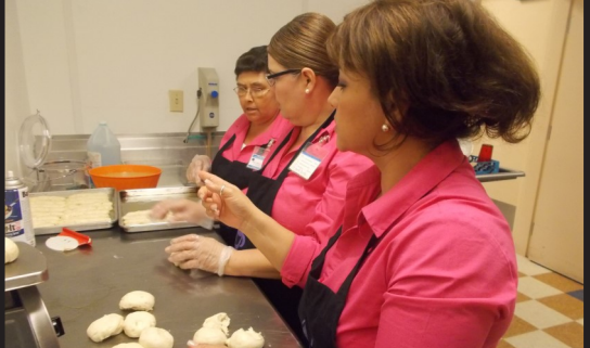
Nutrition & Food Service Externship