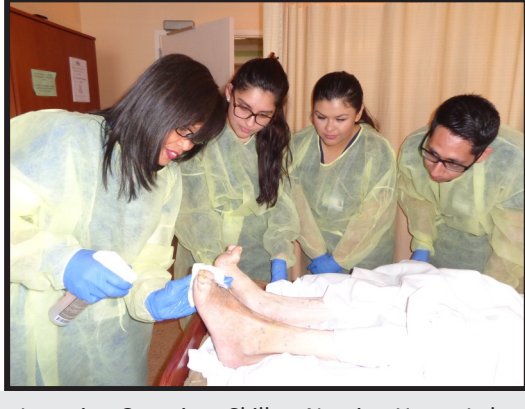
Learning Caregiver Skills-Nursing Home Lab