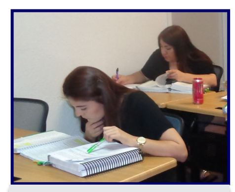
Classroom Instruction for Medical Coder & Biller (Somerton, AZ)