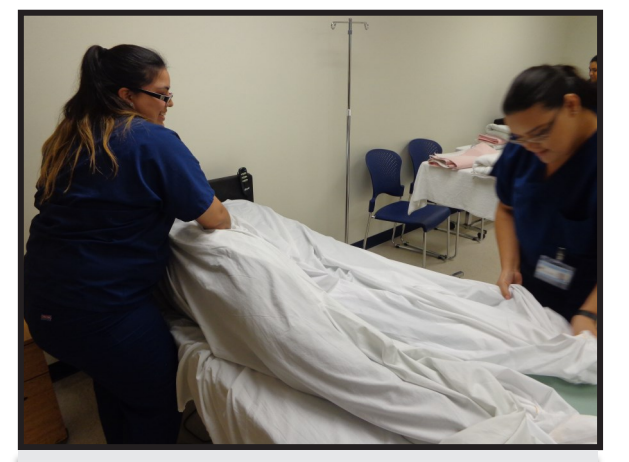
Practice at its best Somerton, AZ

Clock hours awarded:2 Lecture hoursPrerequisites:Medication Administration