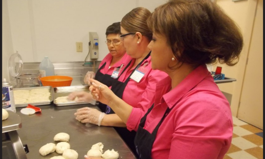
Nutrition & Food Service Externship